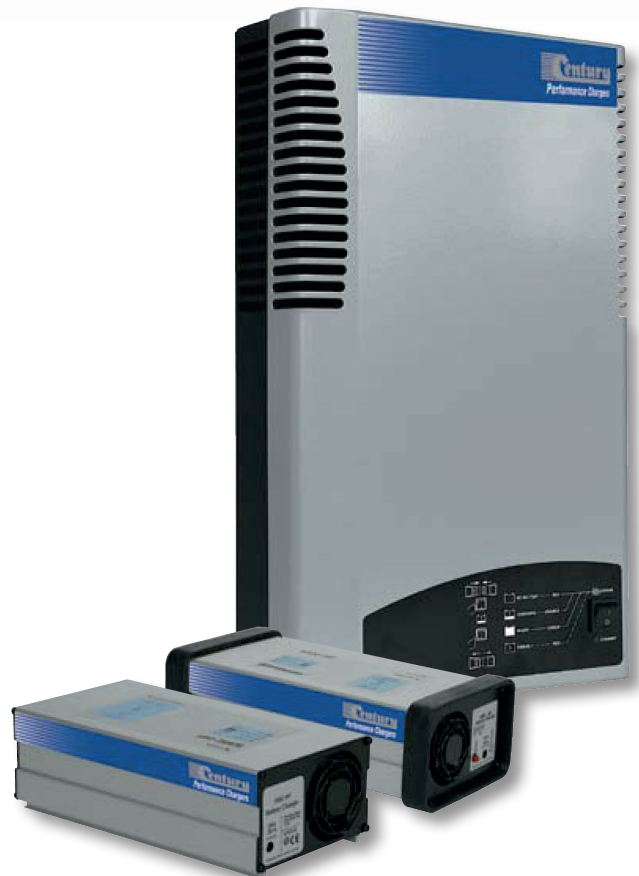
Left & middle: 24V 30A, 45A, 60A Right: 24V120A, all 36V, 48V & 80V